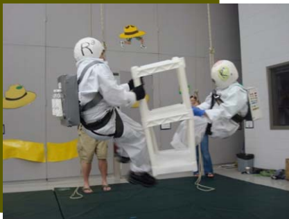
Astronauts from the R3 crew assemble their project..