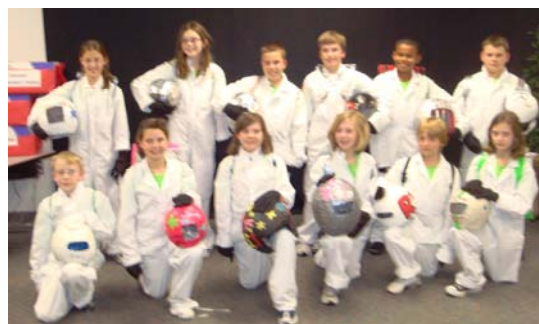
The RISE astronauts pose for a group photo.