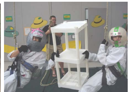
Astronauts from the Smiling Starz crew completed their project in a record 55 seconds.